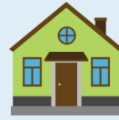
Certified Family Child Care Home