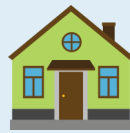
Certified Family Child Care Home