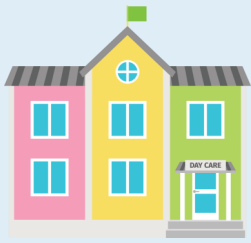
Licensed Type I

Total Number of Child Care Facilities: 7