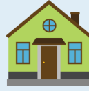
Certified Family Child Care Home