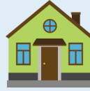
Certified Family Child Care Home