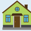
Certified Family Child Care Home