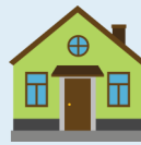
Certified Family Child Care Home