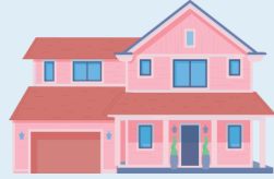
Licensed Type II