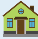
Certified Family Child Care Home