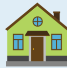
Certified Family Child Care Home